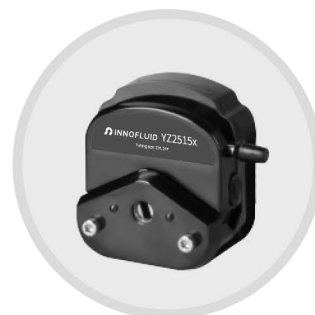
EasyPump Pump Head